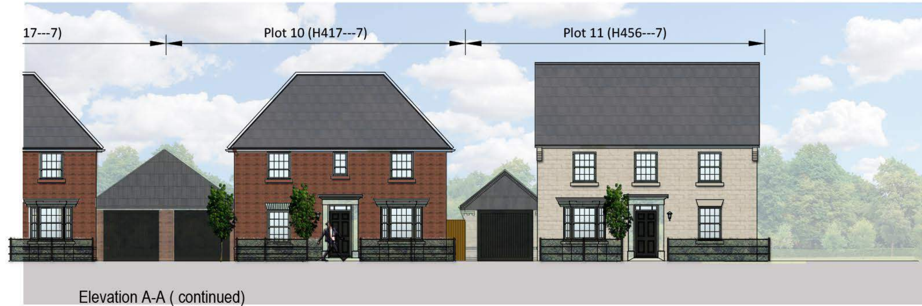
Elevation A-A ( continued)