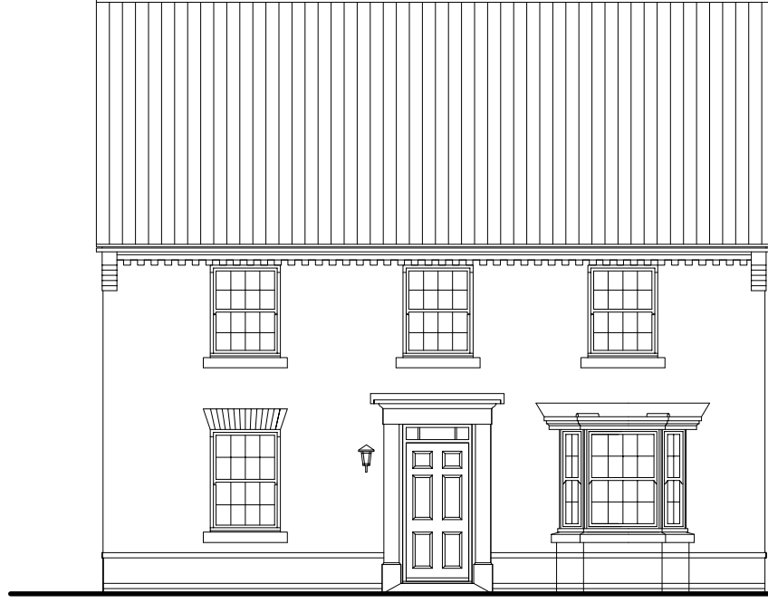
FRONT ELEVATION 1