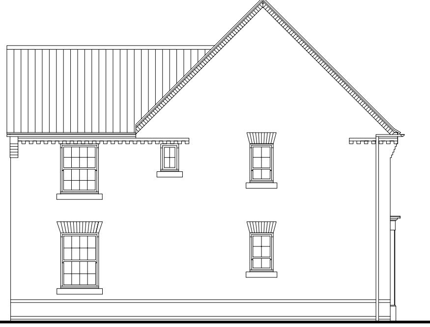
FRONT ELEVATION 2