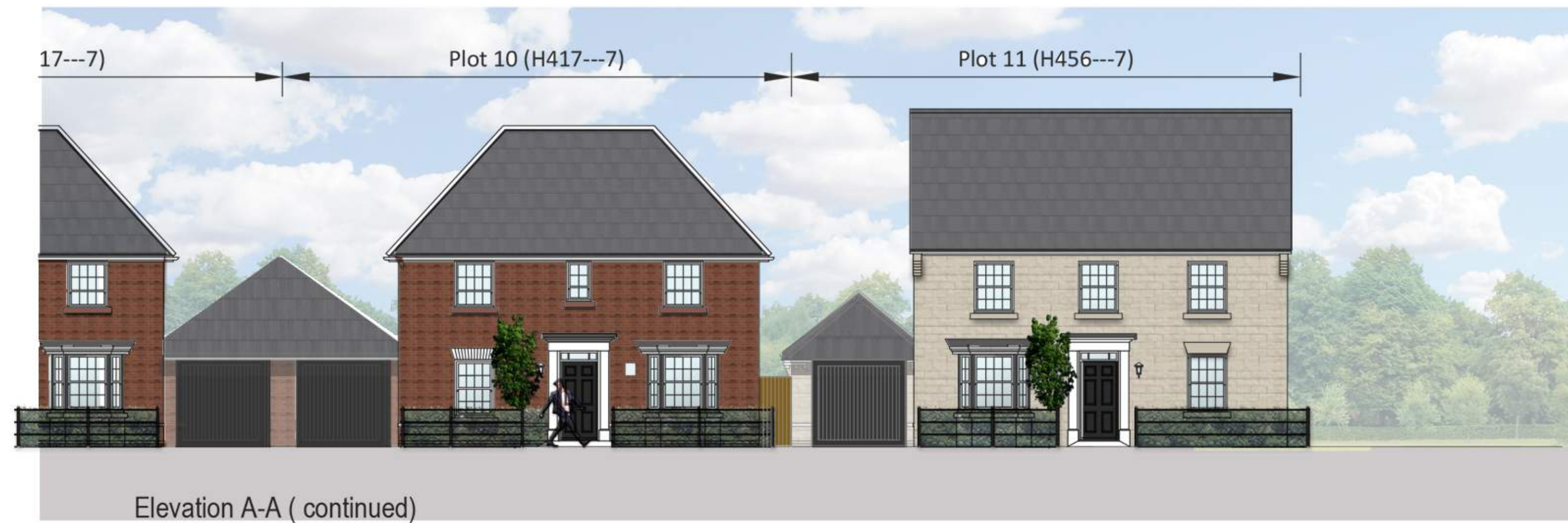
Elevation A-A ( continued)