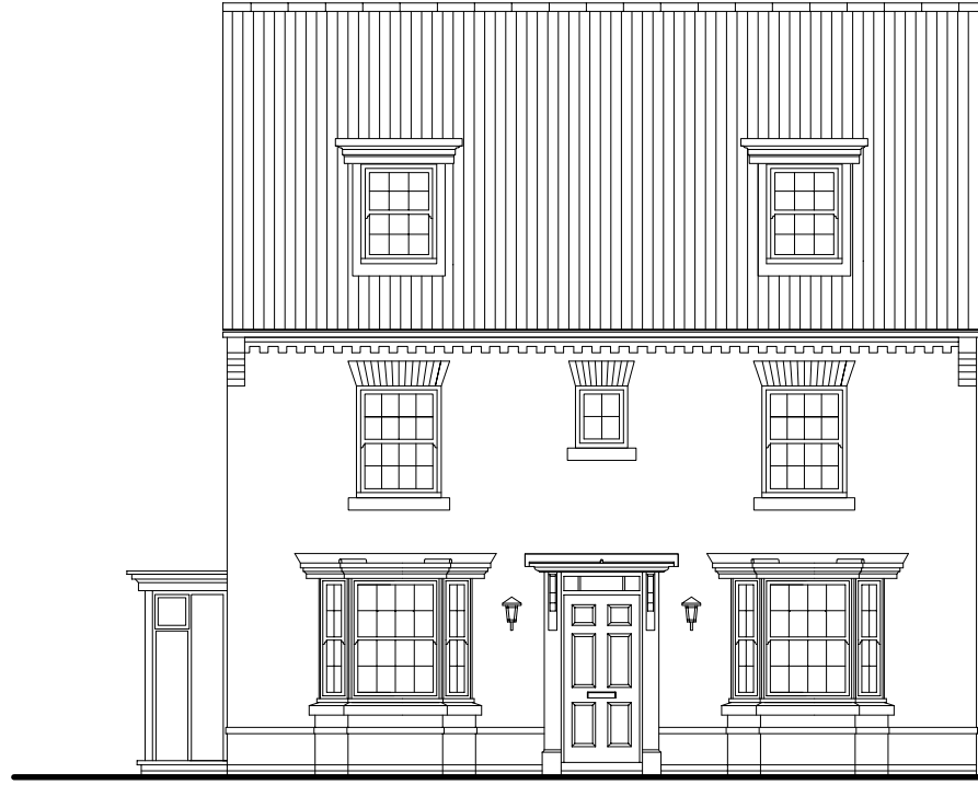
FRONT ELEVATION 1