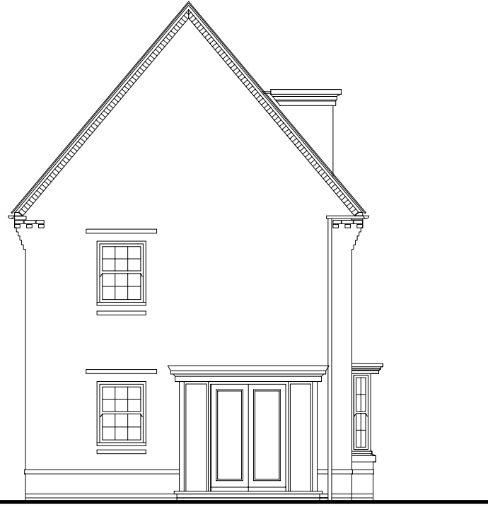
FRONT ELEVATION 2