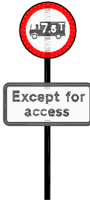
4 - WEIGHT RESTRICTION SIGNAGE UPON ENTRY TO DOWNGRADED SECTION OF LONGMEANYGATE