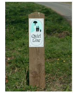
1 - BOLLARD TO DENOTE START OF QUIET LANE