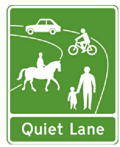
2 - SIGNAGE TO DENOTE START OF QUIET LANE