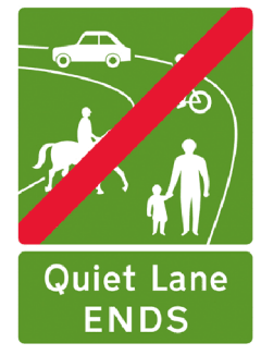
3 - SIGNAGE TO DENOTE END OF QUIET LANE